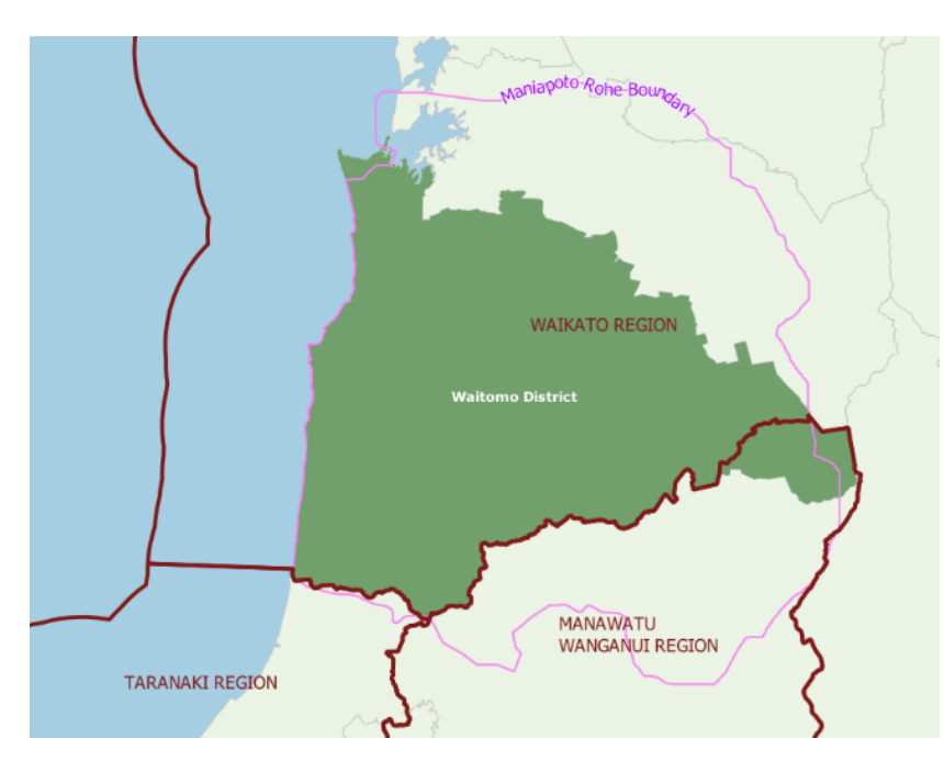
Figure 3 - Resource Management Act responsibilities and where they have effect